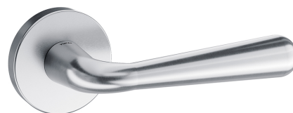
Finish Photographed: Satin Chrome (SC)