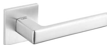
Finish Photographed: Satin Chrome (SC)