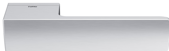
Finish Photographed: Satin Chrome (SC)