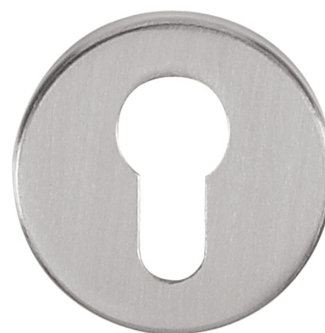
Finish Photographed: Satin Chrome (SC)