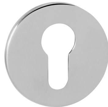
Finish Photographed: Polished Chrome (PC)