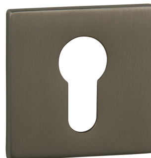
Finish Photographed: Titanium (TT)