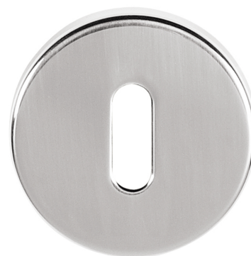
Finish Photographed: Polished Chrome (PC)