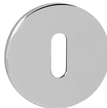
Finish Photographed: Satin Chrome (SC)