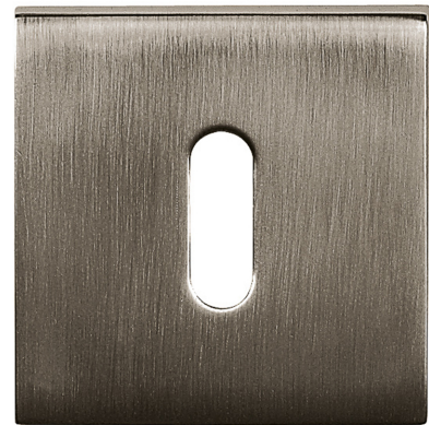
Finish Photographed: Titanium (TT)