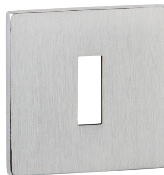
Finish Photographed: Satin Chrome (SC)