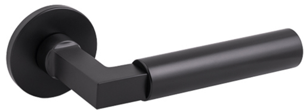
Finish Photographed: Matt Black (MB)