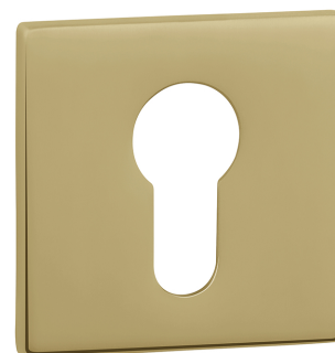
Finish Photographed: Raw Brass (RB)