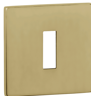
Finish Photographed: Raw Brass (RB)